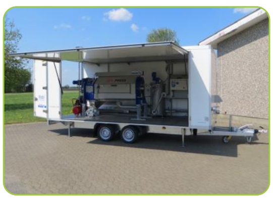
Mobile sludge dewatering with IEA screw press - Assens Forsyning