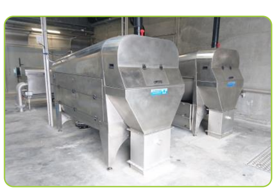
Sludge thickening - Solrødgaard WWTP, Hillerød