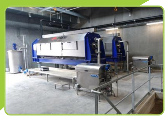
Sludge dewatering with IEA screw press - Solrødgaard WWTP, Hillerød