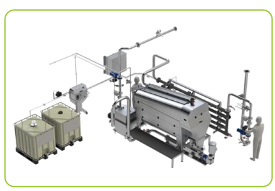
Wastewater separation - Skövde Slakteri, Sverige