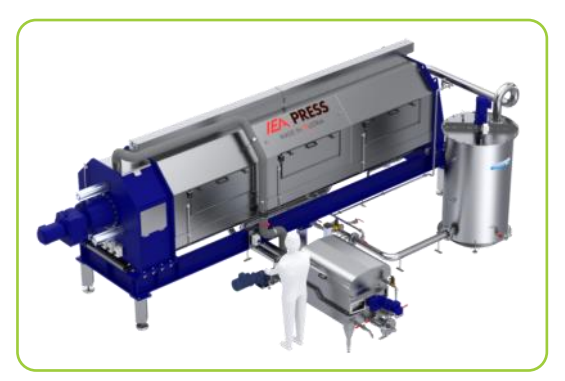
Sludge dewatering with IEA screw press - Växjö, Sverige